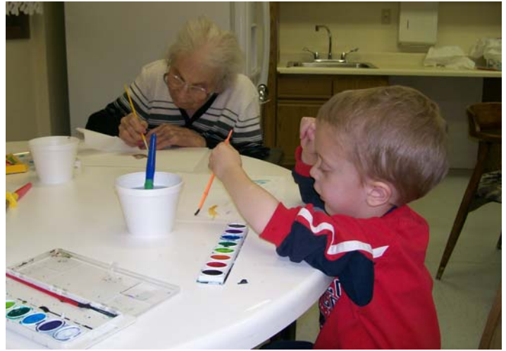
Elders from BCHCC and children from KKLC meet once a week to work on intergenerational art projects, and the activity has been a favorite of many.

These questions and comments are designed to help children become aware of what they are doing and develop their thinking skills.